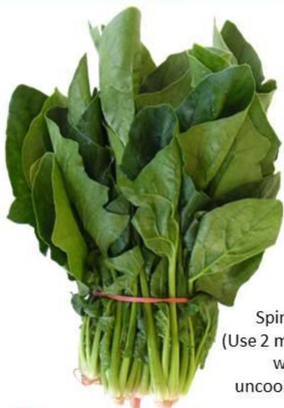
Spinach (Use 2 mugs when uncooked)

CD CDRO Copyright –John Austin © Australia 2017. RO Licence Personal Use AHP-A0-6/2015 Expiry date:31 Dec 2019