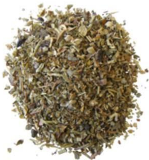
Italian mixed herbs